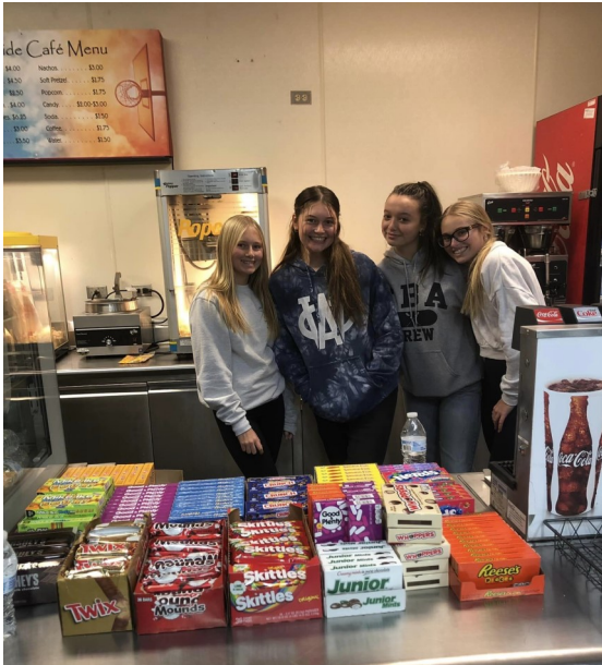
WCA students volunteering at the annual Boardwalk Basketball Classic at the Wildwood Convention Center