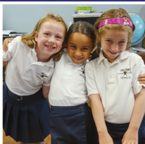
leaders for life....