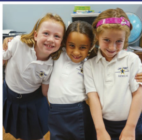
leaders for life....