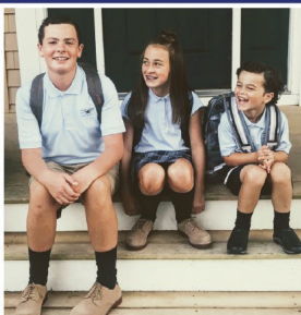
rooted in faith