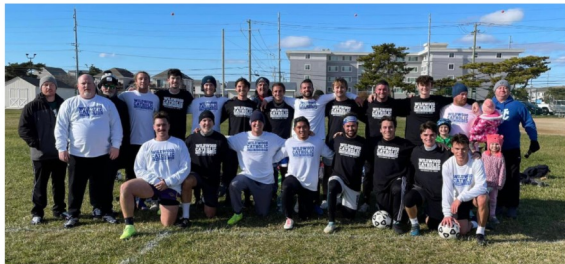
25th Annual Soccer Alumni Game